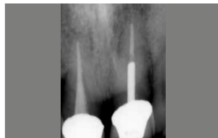
Fig. 3: Initial radiograph. Notice that the adjacent central incisor has endodontic and post therapy.