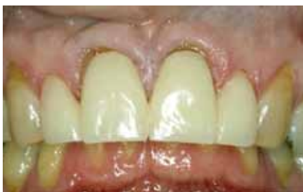
Fig. 7: The provisional bridge also serves as a surgical stent. It shows the location of the gingival margins at the start of the procedure which is useful if these are to be moved.