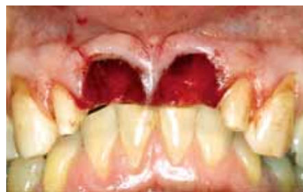
Fig. 8: The roots of the two central incisors have now been removed and the bone sockets curetted and inspected. The sockets are intact though very wide (8 mm).