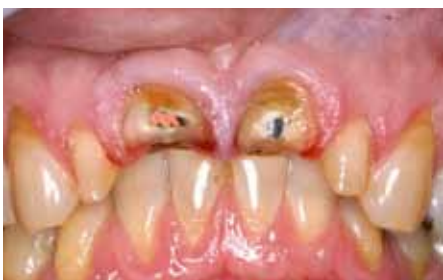
Fig. 6: The two central incisors were sectioned off at gum level and the lateral incisors were prepared for crowns. This ensured a clean operating field while fitting the provisional restoration.