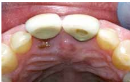
Fig. 2: Palatal view, which shows the evident fracture of the supporting tooth.