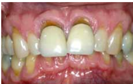
Fig. 1: Original view. The right central incisor is mobile and slightly extruded.