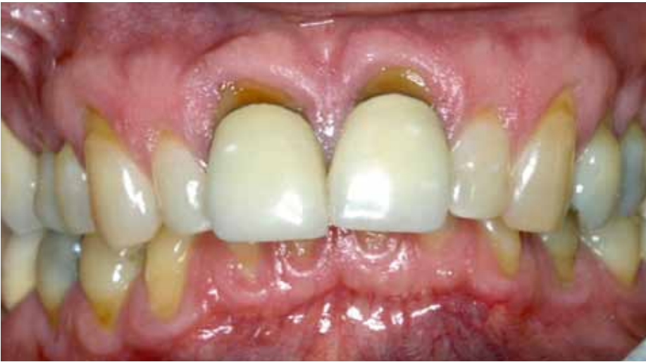
Fig. 23: Many different treatment plans could have been applied to this situation. It was necessary not only to replace the fractured tooth but also to stabilize the supporting structures. In the process it was desirable to enhance the esthetics.