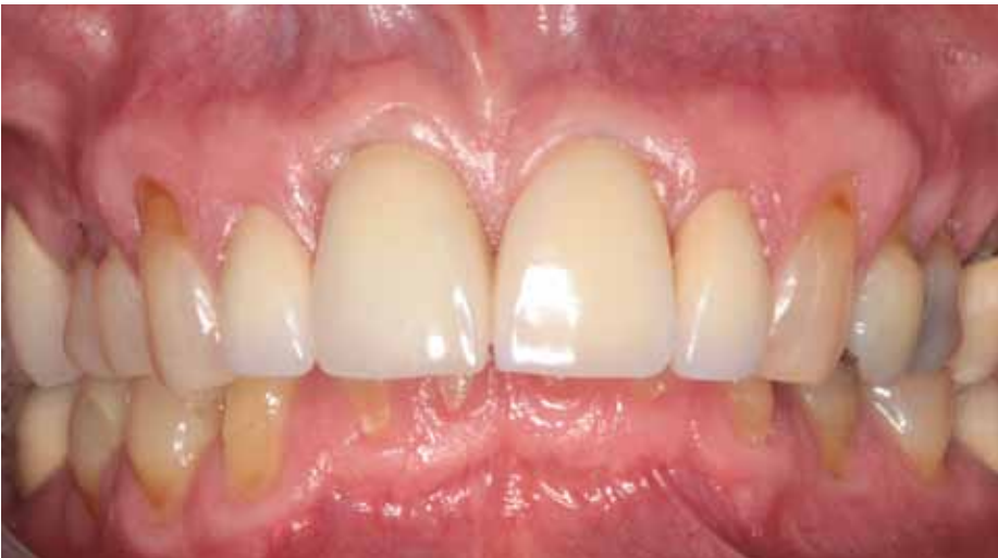
Fig. 25: At the five year recall, it can be seen that the goals of therapy were met and that the final situation is not only stable and functional but also esthetic.