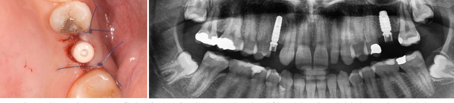
Fig. 9: To achieve an esthetic emergence profile, the Fig. 10: A radiographic image was taken at the end of the surgical procedure to check the situation. It shows an iSy implant soft tissue around the gingiva former in region 26 was with Ø 3.8 mm and a length of 13 mm in region 13 and in region 26 an implant of Ø 4.4 mm / L 11 mm with the premounted implant bases that bear the PEEK gingiva formers.

palatal flap not detached. The drill sequence in the iSy System is made up of a round burr, the Ø 2.8 mm pilot drill, and the single-patient form drill corresponding to the implant diameter, with the latter being supplied with the implant (Fig. 3 to 5) .