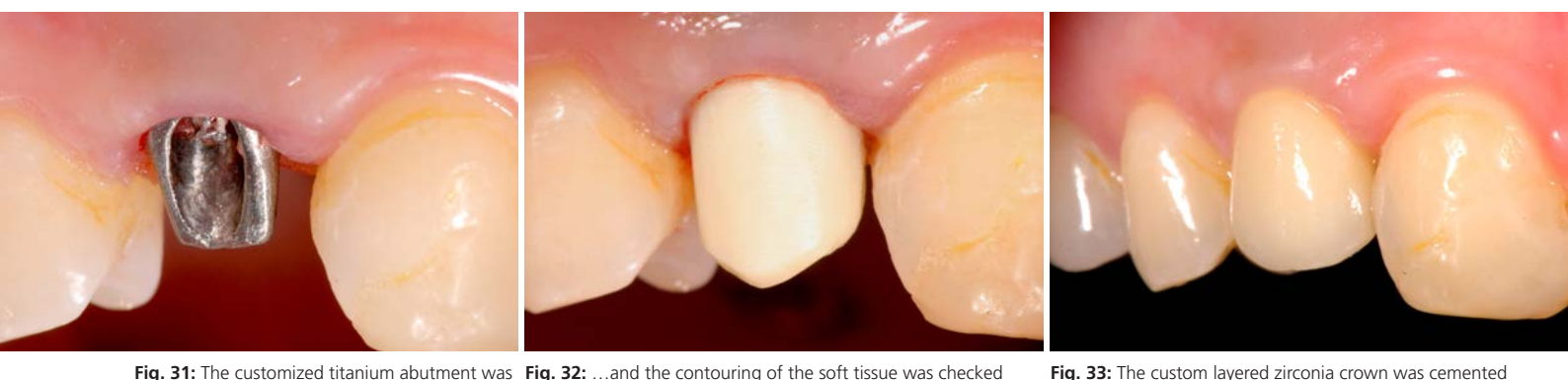
Fig. 31: The customized titanium abutment was Fig. 32: ...and the contouring of the soft tissue was checked screwed in... with the zirconia crown framework.

IPS e.max<sup>®</sup> CAD is polished in a "soft" interim stage in which the material has a bluish color. The customization can then be carried out using e.max<sup>®</sup> Ceram stains and a subsequent crystallization firing at 840–850°C during which the final tensile strength of 360 MPa and the desired properties such as tooth color, translucency, and brightness are produced.