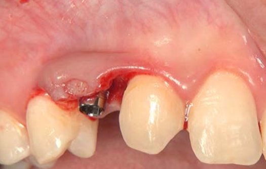
Fig. 5: The iSy implant underwent transgingival healing. The basal parts of the attached gingiva of the vestibular and palatal flaps were not detached.