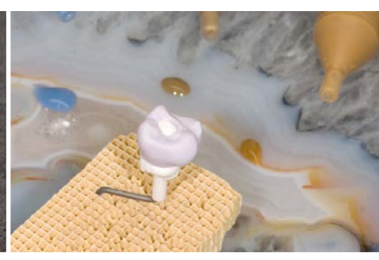
Fig. 27: The "blue" crown was customized before the firing process using staining shades.