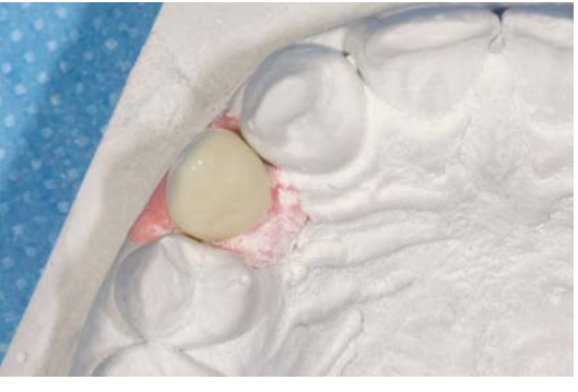
Fig. 22: The temporary restoration was fabricated in the CAD/CAM process using high-performance PMMA.