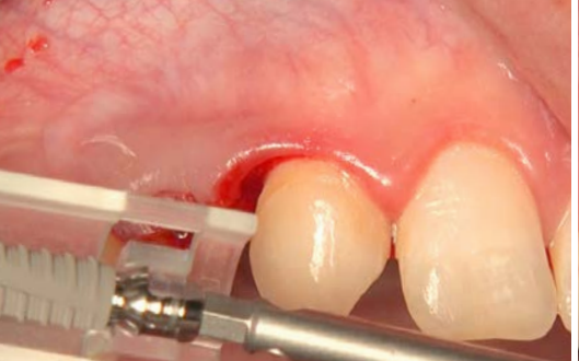
Fig. 4: The iSy implant was inserted according to the iSy drilling protocol using the pilot drill and single-patient form drill.