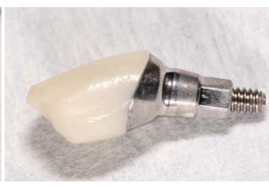
Fig. 30: In region 13 a slender titanium abutment was used to cement an individually veneered zirconia crown.