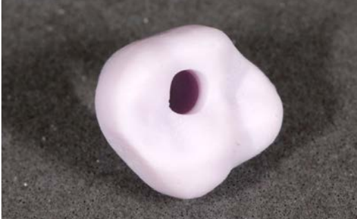
Fig. 25: The hybrid abutment crown was fabricated in region 26 using the CAD/CAM process. the lithium disilicate glass ceramic IPS e.max<sup>®</sup>.