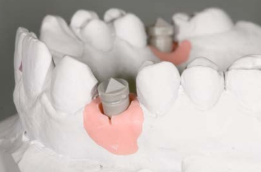
Fig. 21: After the cast fabrication, the implant position was scanned in.