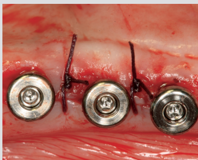
Fig. 2c Implants with healing abutments were left to heal in a transgingival position