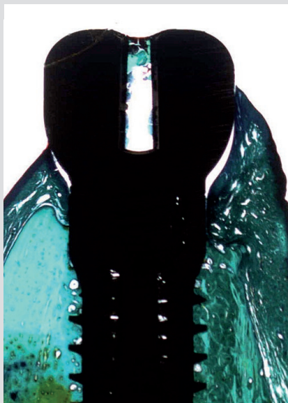
Fig. 3 Histological specimens in the lingual (left) and buccal (right) direction after 6 months of healing (Masson Goldner stain) showing stable crestal bone levels at implants with matching and non-matching healing abutments