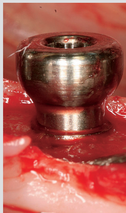
Fig. 2b Inserted implant covered with a nonmatching healing abutment (platform switching)