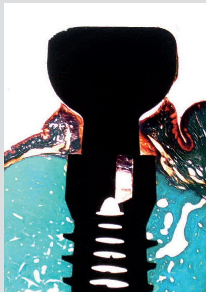
Fig. 3b Implant with non- matching healing abutment (platform switching)

While at 8 weeks the wound healing was characterized mainly by parallel fibered bone, at 12 weeks the deposition was predominated by mature lamellar bone. Bone loss tended to be slightly increased for the control implants compared to the platform switched implants as was measured by the distance between implant shoulder and crestal bone level (IS-BC). At 12 weeks, the difference of IS-BC between control and test implants was at the buccal aspect 0.5 mm and at the lingual aspect 0.4 mm ( p < 0.05 ; unpaired t-test), respectively. A similar result could be observed at 24 weeks when remodelling at the alveolar crestal bone seemed to decline (Fig 3). The difference of IS-BC between both groups was settling down to approximately 0.3 mm.